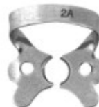
2520 - 2A Winged