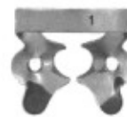
2517 - 1 Winged