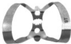
2511 - 9T Winged Edged Labial Clamp