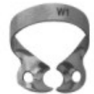
2519 - W1 Wingless

For General Use With Adjustable Jaws According To Gingival Line Shapes