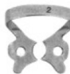
2523 - 2 Winged