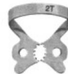
2524 - 2T Edged, Winged