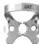
2521 - 2AT Edged, Winged