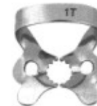
2518 - 1T Winged