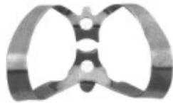
2510 - 9 Winged Labial Clamp