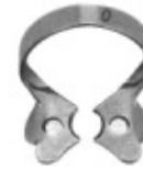
2515 - 0 Winged