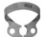
2522 - W2A Wingless