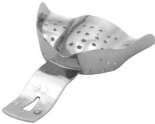
3329 For partially toothed upper jaws