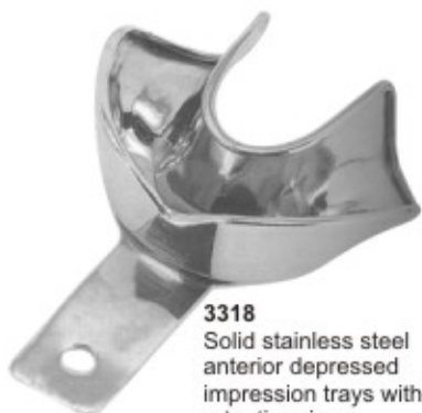
3318 Solid stainless steel anterior depressed impression trays with retention rim.