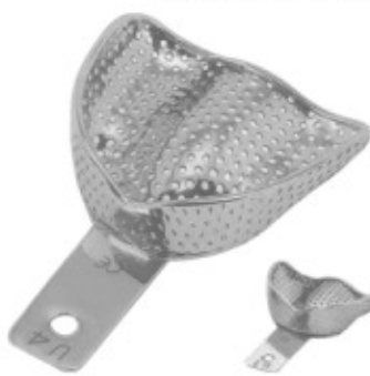
3337 Perforated stainless steel anterior depressed impression trays with retention rim.