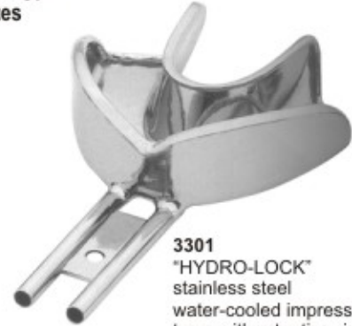
3301 "HYDRO-LOCK" stainless steel water-cooled impression trays with retention rim.