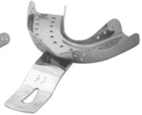
3328 Fig. 0 per bambini - for children