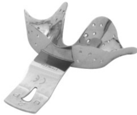
3330 For partially toothed lower jaws