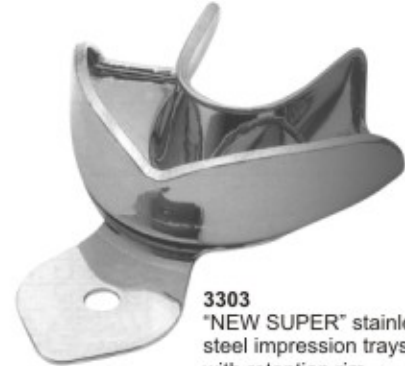
3303 "NEW SUPER" stainless steel impression trays with retention rim.