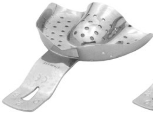
3326 Fig. 0 per bambini - for children

All Impression Trays Upper & Lower Type are available in S, M, L & XL Sizes