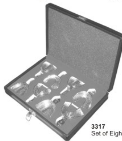
3317 Set of Eight