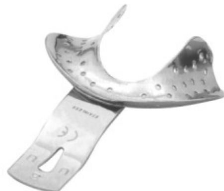
3332 For edentulous lower jaws