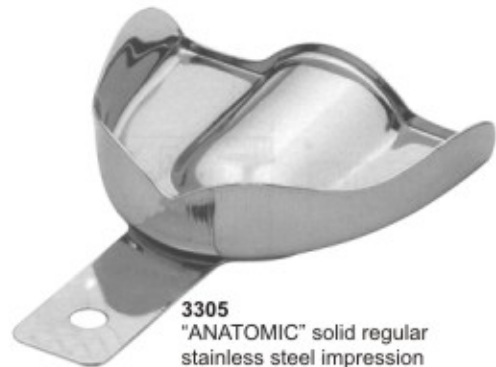
3305 "ANATOMIC" solid regular stainless steel impression trays without retention rim.