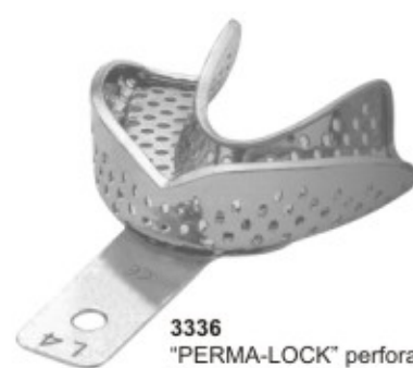
3336 "PERMA-LOCK" perforated regular stainless steel impression trays with retention rim.