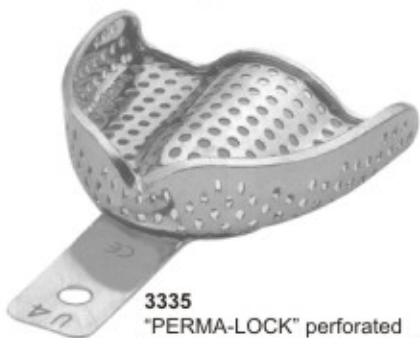
3335 "PERMA-LOCK" perforated regular stainless steel impression trays with retention rim.