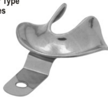
3334 Solid total denture stainless steel impression tray with rim.