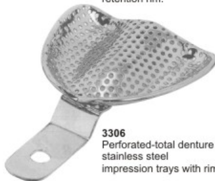
3306 Perforated-total denture stainless steel impression trays with rim.