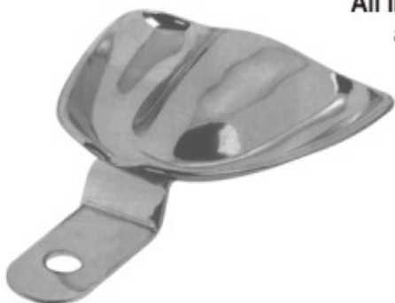
3333 Solid total denture stainless steel impression tray with rim.

All Impression Trays Upper & Lower Type are available in S, M, L & XL Sizes