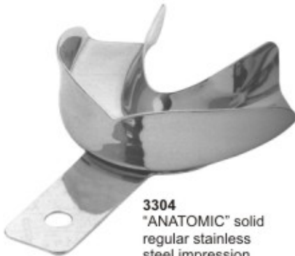
3304 "ANATOMIC" solid regular stainless steel impression trays without retention rim.