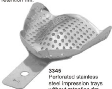
3345 Perforated stainless steel impression trays without retention rim for complete denture.