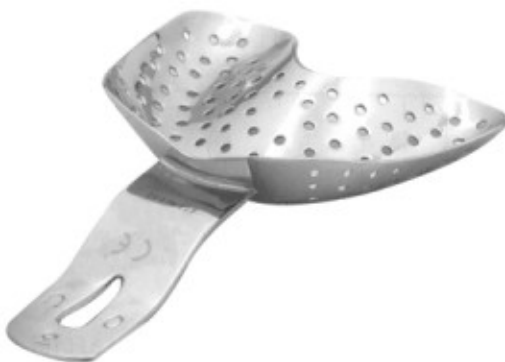
3331 For edentulous upper jaws