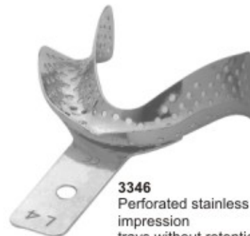
3346 Perforated stainless steel impression trays without retention rim for complete denture.