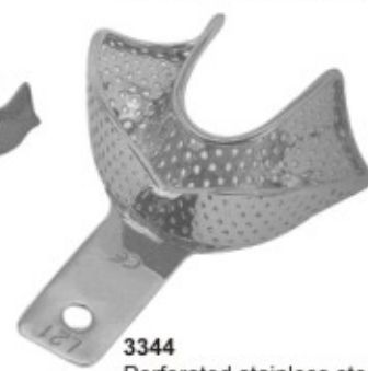
3344 Perforated stainless steel anterior depressed impression trays with retention rim.