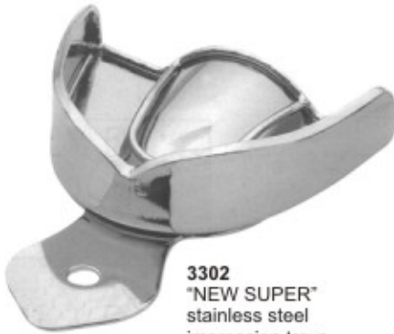
3302 "NEW SUPER" stainless steel impression trays with retention rim.