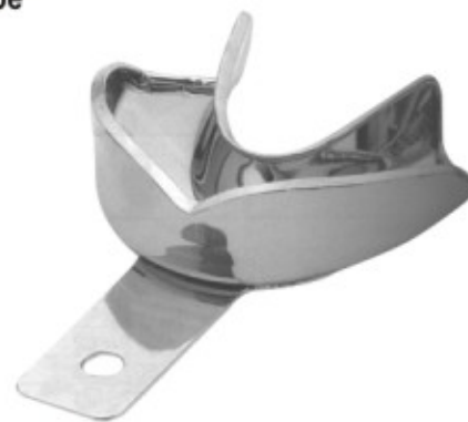
3309 "PERMA-LOCK" solid regular stainless steel impression trays with retention rim.