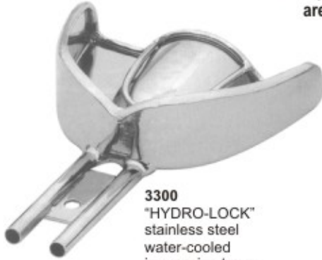
3300 "HYDRO-LOCK" stainless steel water-cooled impression trays with retention rim.

All Impression Trays Upper & Lower Type are available in S, M, L & XL Sizes