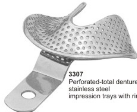
3307 Perforated-total denture stainless steel impression trays with rim.