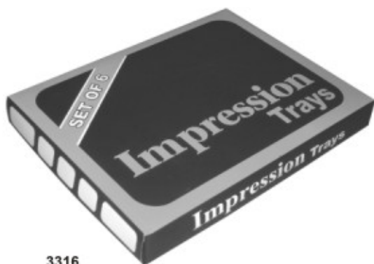
3316 Set of six