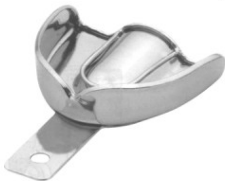
3308 "PERMA-LOCK" solid regular stainless steel impression trays with retention rim.

All Impression Trays Upper & Lower Type are available in S, M, L & XL Sizes