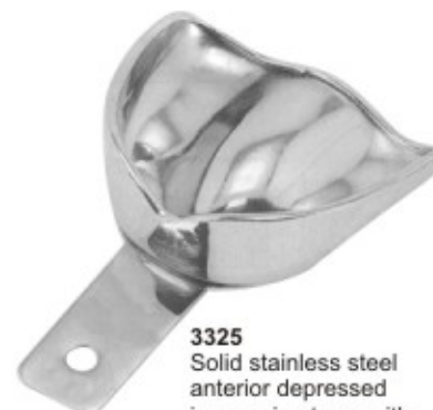
3325 Solid stainless steel anterior depressed impression trays with retention rim.